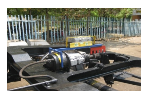
Application of Gadget on IOH bogie