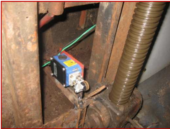
Limit switch placed at hand brake screw

The Hand brake system in GSLRD 03704 has been modified to avoid stalling of train with hand brake applied condition which causes Flat tyre. In the modification a limit switch is positioned at hand brake apparatus which actuates the Solenoid valve connected to BP pipe line to vent out Air from BP when hand brake is in applied position thus BP pressure will not develop. An isolating cock was provided between BP and solenoid valve pipe line to avoid venting of Air from BP in case of solenoid valve failure