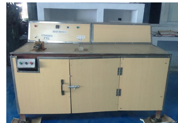
Centrifugal air strainer test rig

This is being used at Carriage Works/Perambur and is working successfully.