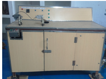
Dump valve test rig